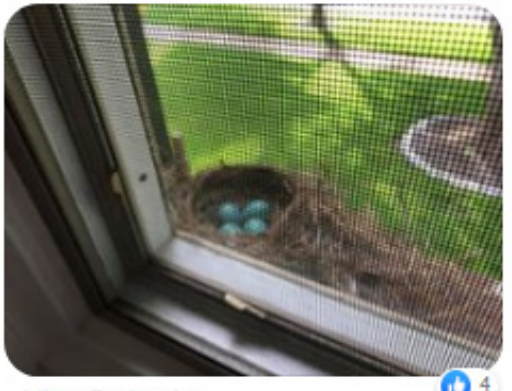
Like · Reply · 1w