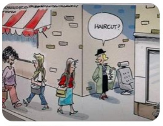
Like · Reply · 1w