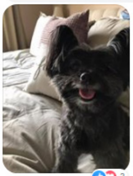
Like · Reply · 1w