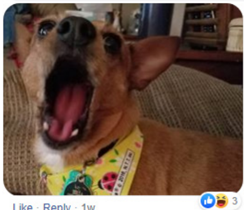
Like · Reply · 1w