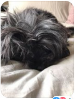
Like · Reply · 1w